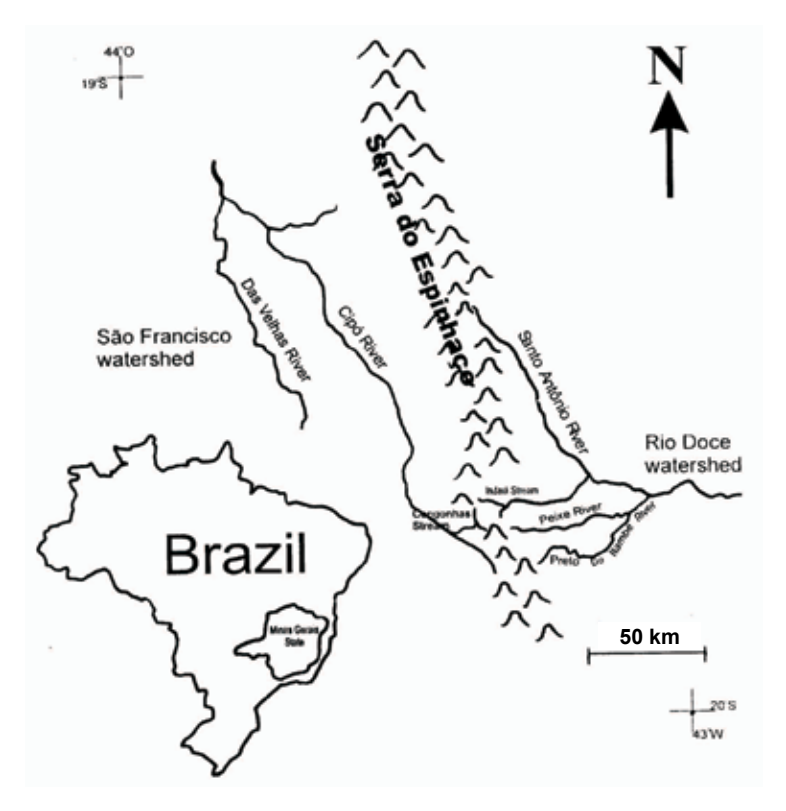
Figure 1. Sampling site locations along the Indaiá Stream in the National Park of Serra do Cipó and the Peixe River.

The Serra do Cipó National Park (19°-20° S; 43°-44° W; Figure 1) has a humid subtropical climate with mild and rainy summers (annual rainfall ca. 1,500 mm, October-March) and dry winters April-September (Koppen, 1936; Galvão and Nimer, 1965). Serra do Cipó (Minas Gerais State) is located in the cerrado biome (a major savannah-like ecosystem) which is regarded as one of the most important biodiversity hotspots in Brazil, with a high diversity of plant and animal species, many of them endemic (Cota et al., 2002). A longitudinal